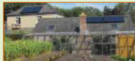
6.9m 2 and 4.6m 2 on roof systems - showing the portrait and landscape styles that can be installed.