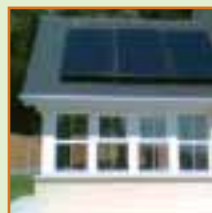
3 panel system in Co. Galway