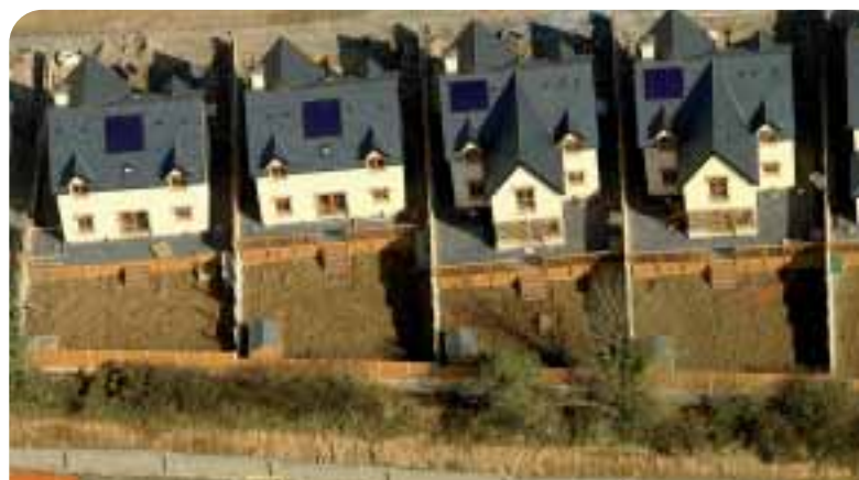
2 panel in-roof systems on a luxury development in Co Cork by Fleming Construction